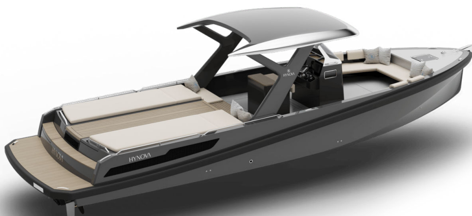
3D rendering of HYNova 40 "The New Era"